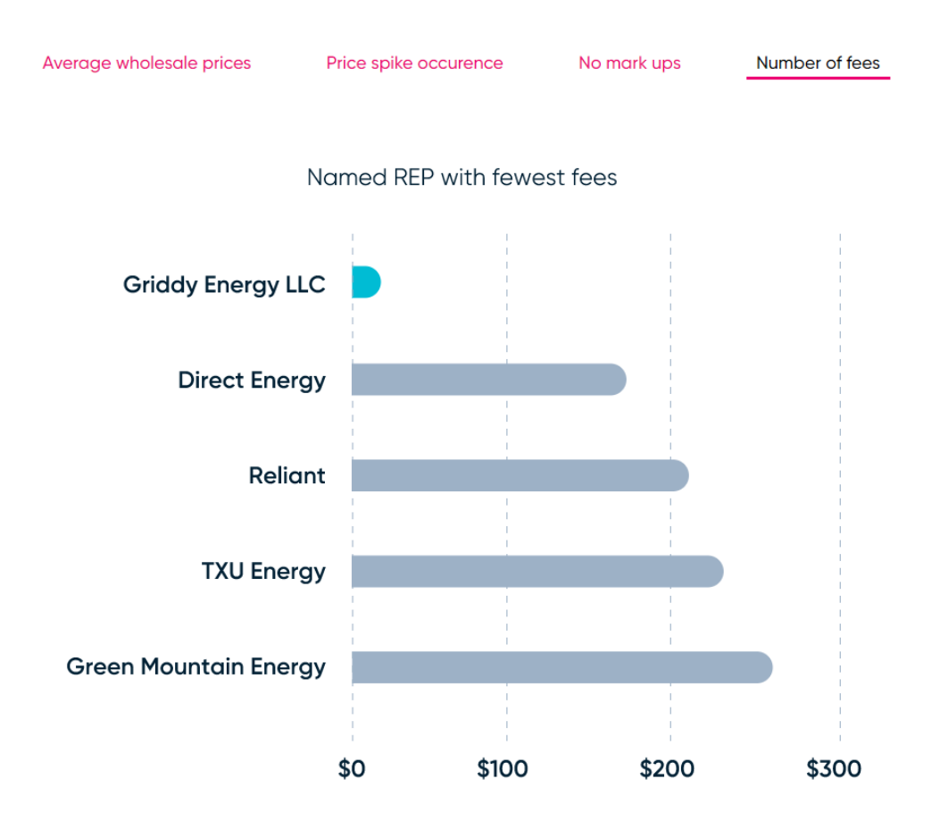
Wholesale beats the TX average 96% of the time

/ $120 a year) to fees from traditional retail electricity providers (REPs):