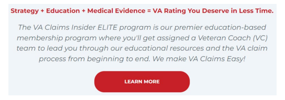
Figure 7 (screenshot of online advertisement)

26. VACI's representations that it does not assist Clients with the preparation of VA disability claims and that VACI will not have access to the client's private VA account are also inconsistent with complaints filed by consumers, who state that VACI requested them to provide confidential login information needed to access their personal eBenefits VA portal and that as part of VACI's education-based coaching, consumers are instructed on specifics including what to put in the applications.