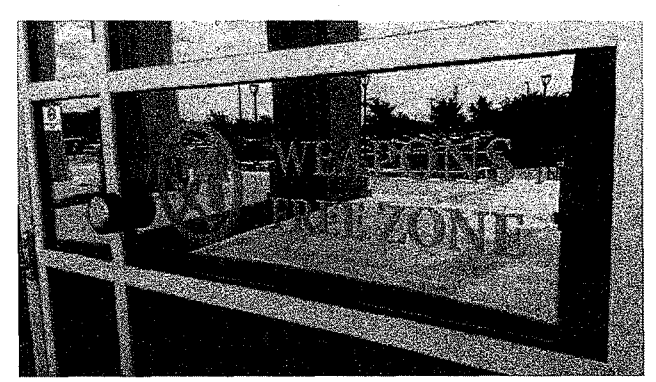
Signage at entrance to Hays County Government Center

Currently, several signs in the parking lot and on the glass frontage of the building read "Weapons Free Zone" as depicted here: